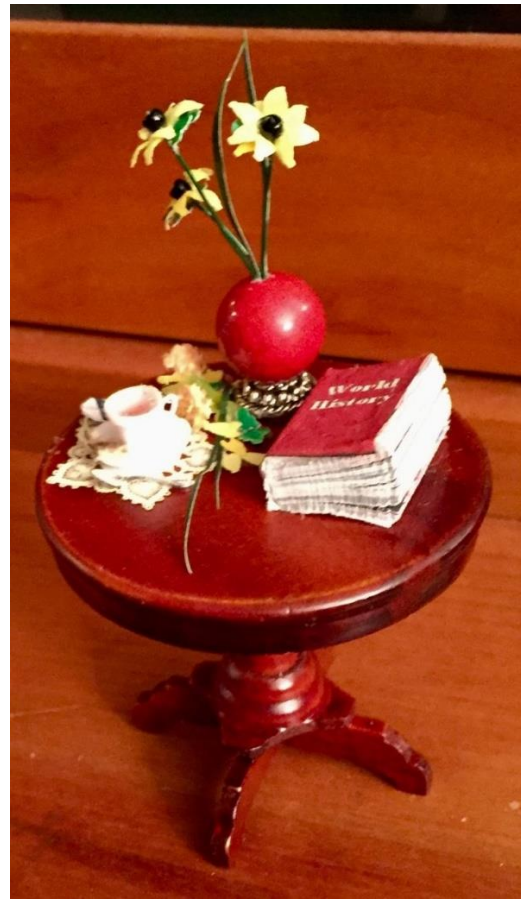
Winterthur...A finished table with fallen petals